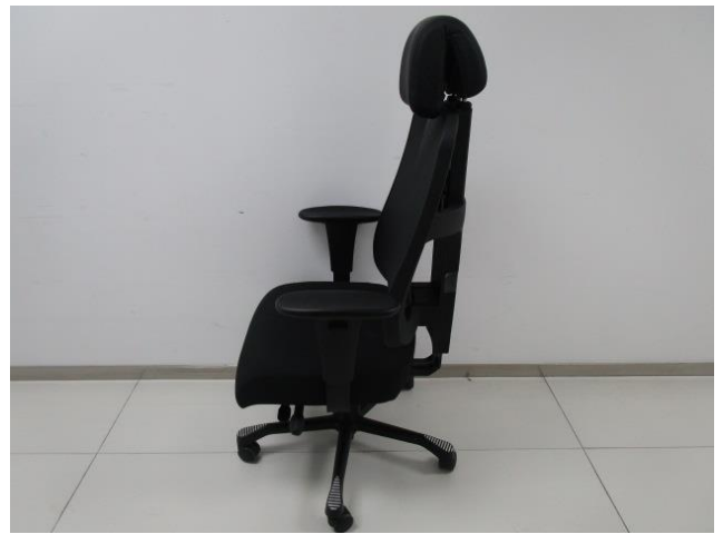
Pic. 2: Side view