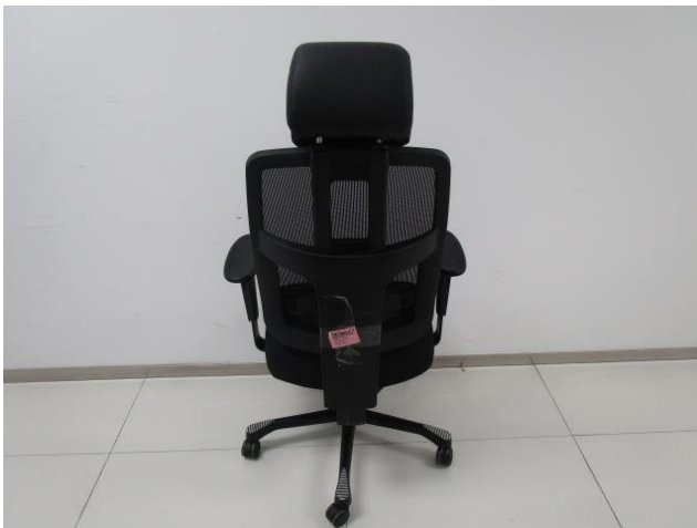
Pic. 3: Back view